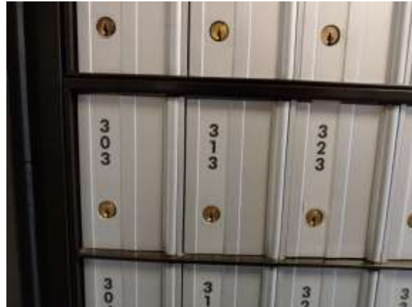
Our secure PO Box 313

Judi Smith Gregory prepared and mailed your 179 invitations. The Taylorsville PO Box 313 will be checked daily for mail. Any checks received will be deposited via 5th 3rd mobile application the day received.