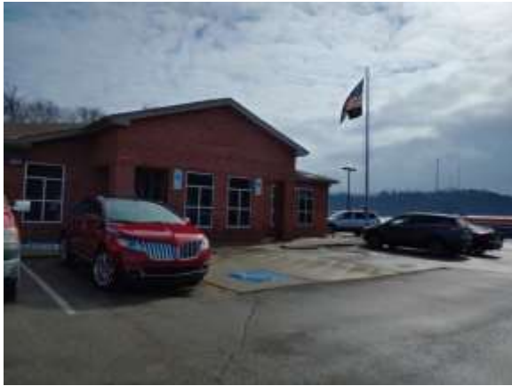
Taylorsville Post Office

Invitation collated, tri folded, stuffed stamped and ready to mail